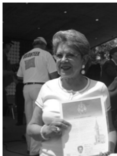
Canada's Citizenship Week is an annual event celebrating the value of citizenship

THE HOMEWORK CLUB RUNS EVERY TUESDAY FROM 6:30 TO 8:00 P.M AT ALBERT COLLEGE.