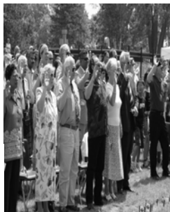
New citizens being sworn in at the Citizenship Ceremony July 1, 2006

The Resource Centre also provides the tools necessary to facilitate employment searches in Canada such as a job lead board, computers, the internet, photocopier and fax machine.