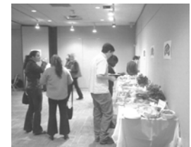
THE BUFFET FEATURED DISHES FROM CHINA, PHILIPPINES, JAMAICA, BRAZIL, VIETNAM, LEBANON, MEXICO, CUBA, AND TIBET.