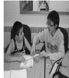
The Homework Club runs each Tuesday evening from 6:30 p.m. to 8:00 p.m. at Albert College.